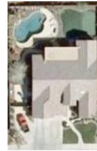
1516 Oxford Lane,

Comments: Lender owned! Well designed single level floor plan situated on a premium park view lot at the end of a cul-de sac! Features include: 10 foot ceilings, 8 ft doors, plantation shutters, travertine floors, granite countertops in the kitchen, 42 inch raised panel oak cabinets. Backyard boasts a refreshing pebble-tec pool with rock waterfall. Sold as -is. *** owner occupants-seller will pay up to 3.5% towards financed closing costs on accepted