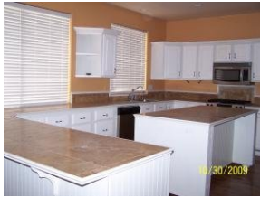
1499 Del Rio Street,