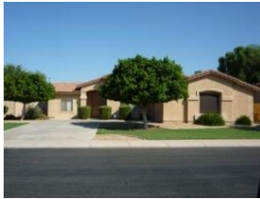
1496 Harrison Street,

Comments: Highly sought after ashland ranch. This home has a great floor plan. Tile counters, pergo flooring, custom wine pantry, huge laundry room, formal living and dining, plus family room off kitchen. Nice sized yard, room for pool. 4 garages, great for the two cars you use and the two that are classics. Or...Use the other two for all the stuff you have you can't seem to get rid of. Master is very nice sized and the master bath has been redone with very cool pedestal