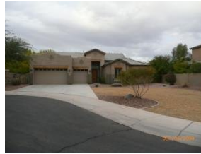
1046 Oakland Court,

Comments: Adorable 3 bedroom, 2 bath home in the high in demand community of ashland ranch! Custom paint t/o home! Tile, laminate, and carpet in all the right places! Enjoy the outside while swimming in the refreshing pool. This home won't last. Short sale!