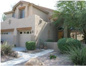
1349 Harrison Street,