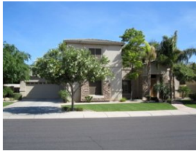
2139 Sailors Way,

Comments: Fabulous short sale opportunity in high demand ashland ranch. One of the best interior lots! Gorgeous backyard w/ shade, shrubs, fruit trees, palms, grass. Extended covered patio w/extended cement for total enjoyment. Fenced pool w/sheer decent waterfall and pour pots. Tile floors throughout most of the main floor. Unique, southwest adobe characteristics, including built-in-custom bookshelves in formal lr.