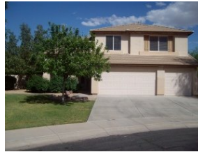
1236 Tyson Court,

Comments: Immaculate matina model in family friendly ashland ranch. A natural stone fireplace and large dining area welcome you. Beautiful engineered wood flooring in family room and adjacent chef's kitchen with granite counters and huge breakfast dining area. Loft play area and giant game/media room with surround pre-wire - plenty of room for arcade games, pool table and home theater! Large secondary bedrooms and baths with silestone